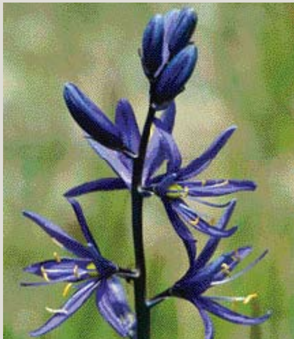
Camas Lily; Camassia quamash.