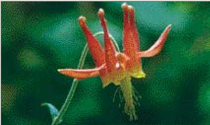
Columbine; Aquilegia formosa.