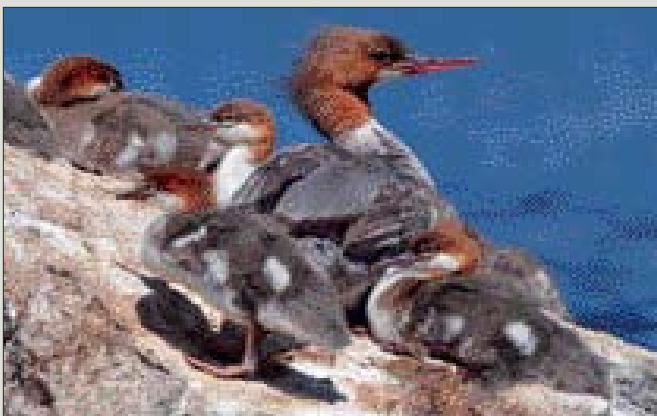
A family of Mergansers at Lake Van Norden.