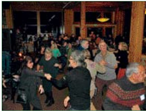
What's a party without dancing?

What was accomplished and what we are still accomplishing is truly extraordinary, not just in the world of land conservation, but in