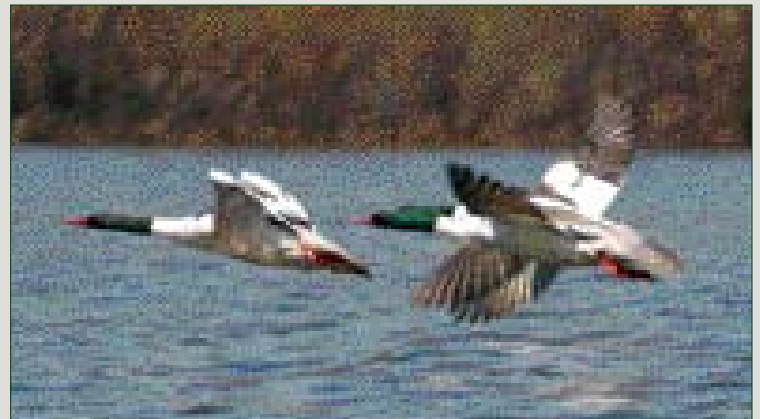
Taking flight on Lake Van Norden.