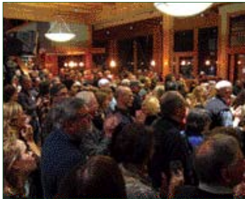
A joyous crowd on hand at Sugar Bowl's Mt. Judah Lodge celebrating the acquisition.

the entire non-profit sector. The Land Trust is proud to be part of a community that not only recognizes the value of preserving iconic landscapes, but is also willing to pay it forward, so that future generations can experience Royal Gorge in perpetuity.