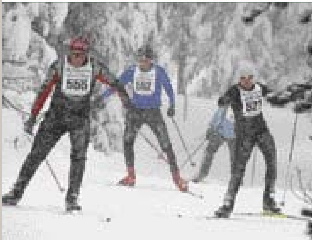
Sugar Bowl will be bringing back a number of popular races and world class competition.

Non-Profit Org. US Postage PAID Permit #1 Kings Beach, CA