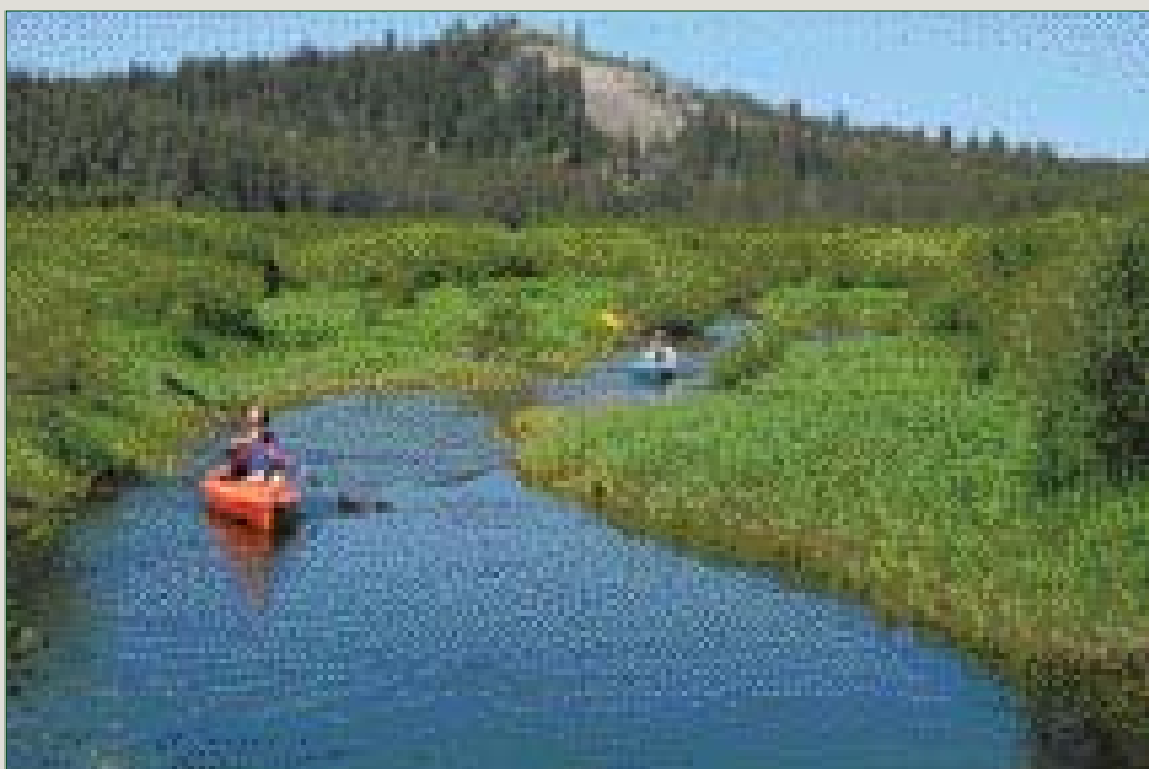
Paddling the spring high water in the upper reaches of Lake Van Norden.